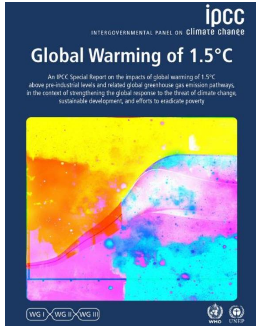
IPCC Global Warming of 1.5 ° C Link